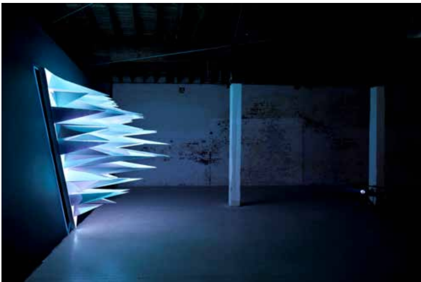
Flynn Talbot / Primary

Installation : Unwoven Light at Rice Gallery © Soo Sunny Park