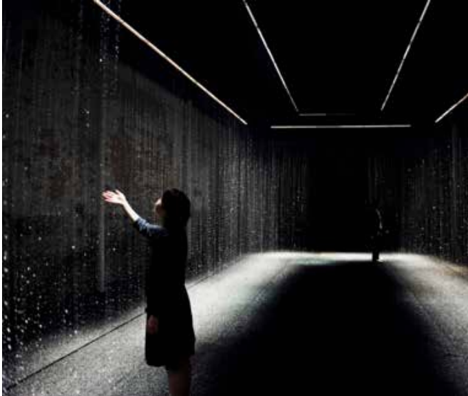
Luce Tempo Luogo par DGT, 2011

LIGHT in WATER is a reinterpretation of the installation shown at the 2011 Salon de Milan, entitled Luce Tempo Luogo. This project gathers creativity and technology in order to offer the viewers a unique and immersive experience. By using the LED system in the dome, DGT creates a magic space with a wall of light, where multiple layers of water curtains are constantly transformed as the result of the effect of countless LED bulbs. The installation explores and demonstrates how new technologies create new value.