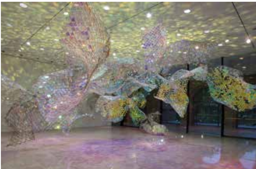
Soo Sunny Park / Unwoven Light (section of)

Installation : Unwoven Light at Rice Gallery © Soo Sunny Park