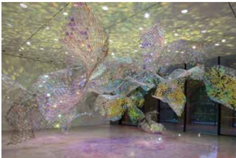
Unwoven Light at Rice Gallery © Soo Sunny Park