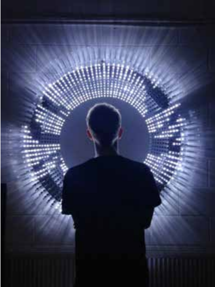
© Alex Asseily en collaboration avec Haberdashery