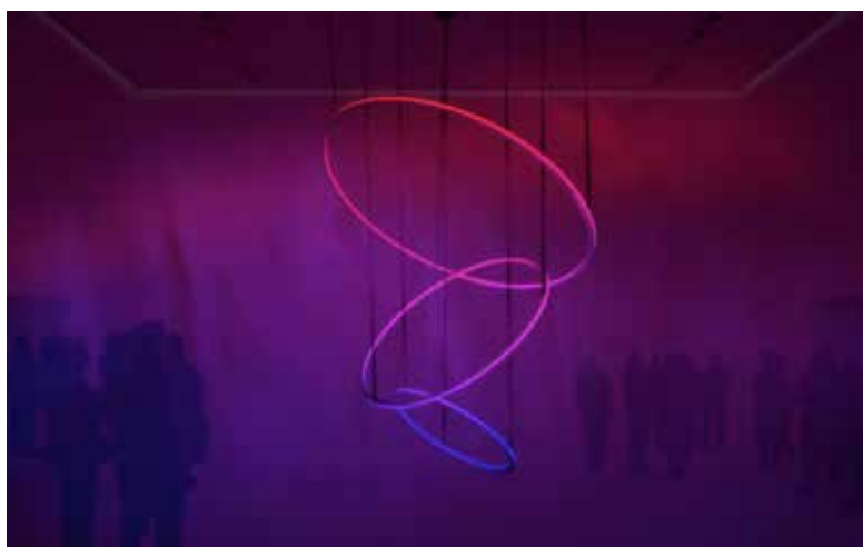
Photo of the installation: Ming, sketch, by Moritz Waldemeyer